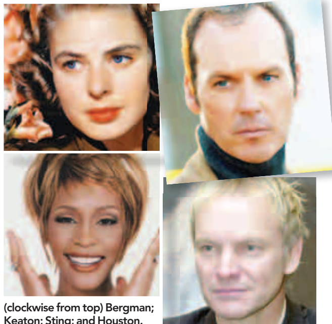
(clockwise from top) Bergman; Keaton; Sting; and Houston.

Some famous Rabbits include Ingrid Bergman, Lewis Carroll, John Cleese, Peter Fonda, Cary Grant, Bob Hope, Michael Keaton, John Keats, Roger Moore, Whitney Houston, George Orwell, Neil Simon, Sting and Orson Welles.